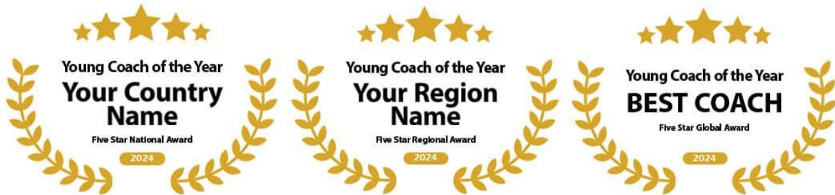
Figure 1- The Young Coach of the Year Awards at three levels: national, regional, and global